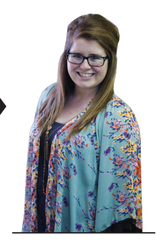
BY LACI JONES

"What we haven't seen is how the courts are going to interpret that statute, or how specific fact See SPACE page 13